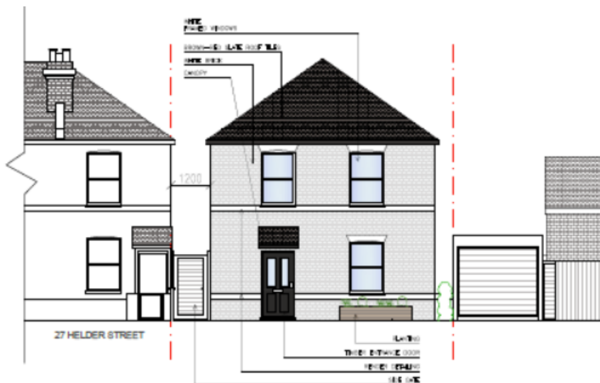
Figure 1: proposed front elevation from Helder Street