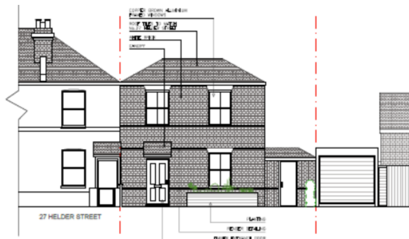
Figure 3: Front elevation as part application 22/02158/FUL